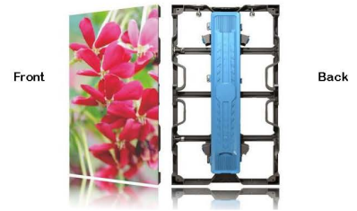
Signal Connection Power Connection